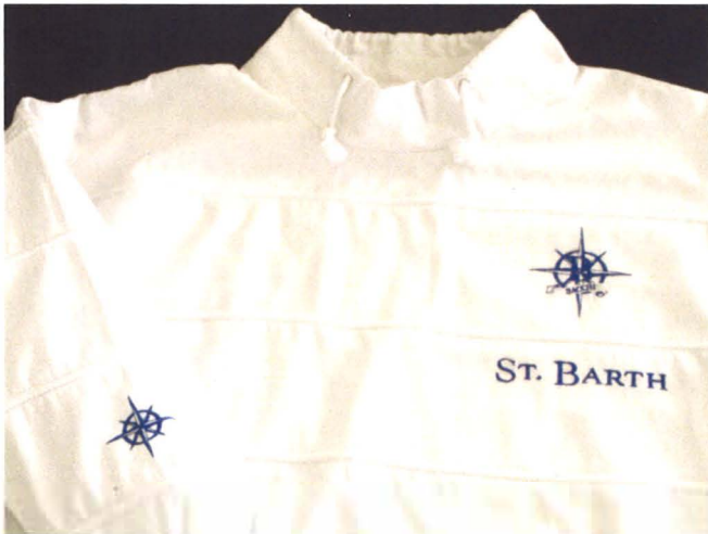
Deep Dive Club in Bermuda Style 5003

Don't let the Bermuda Triangle get the best of you, be part of Bacchi's Deep Dive Club with our exceptional long sleeve. Unlike our classic white, this shirt is reminiscent of the bottomless ocean blue seen only by the most experienced divers. If you find yourself in the shipwreck capital of the Atlantic, avoid the bends with Bacchi.